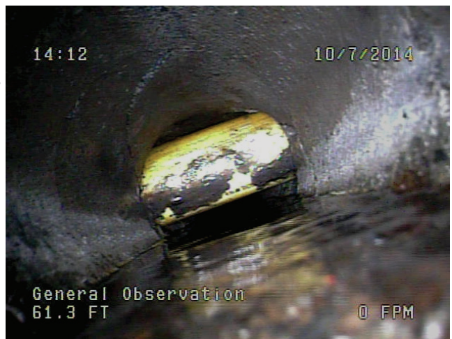
Gas Line Bored Through a Sewer Lateral

5. Develop a means of sharing data, such as lateral records that may have televised already.