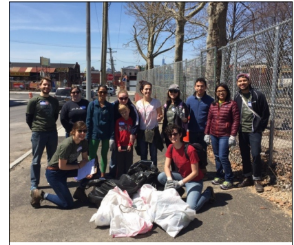
Curb Your Litter: Greenpoint, April 2016

A committee goal is to strengthen the connection between YPs and local student chapters. Several YPs attended University Night at the City College of New York in early March to network with students and hear them present their research. At the event, students filled out surveys on how they want to connect with NYWEA YPs: plans are in the works for future YP/student events.