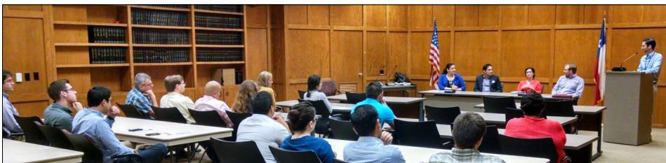
South Texas AWWA/WEAT Fall Forum

The four panelists provided great insight for our South Texas AWWA/WEAT YPs. The Fall Forum occurs every year in mid-to-late October, providing YPs from South Texas an opportunity to network and learn about the