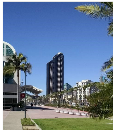
2016 YP Summit - San Diego, CA