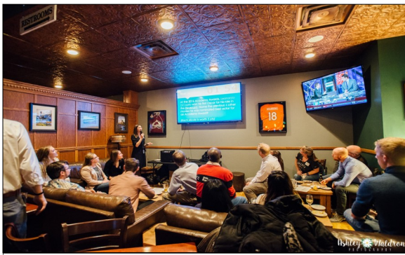
RMWEA Joint Governing Board Trivia Night

The Rocky Mountain Section of WEF has many new and exciting events on the books for 2016! When we plan our events, we strive to create an atmosphere where YP's from all facets of the water industry can make connections and expand their network, while at the same time having fun and learning something new. Here are some of the ways we've accomplished this goal so far in 2016.