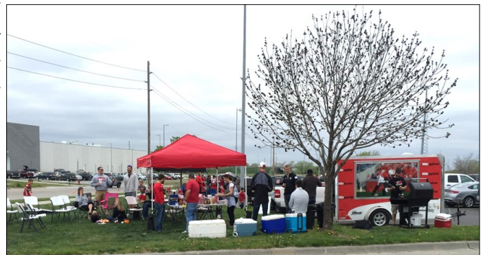
AWWA-NWEA YP Spring Football Tailgate

Thank you to everyone that was instrumental in planning, execution, and teardown of the event. A special note of appreciation is due to Lincoln WinWater who provided the tailgate trailer with all the essentials. The YP Committees look forward to seeing everyone and their families at next year's 2 nd Annual Spring Tailgate.