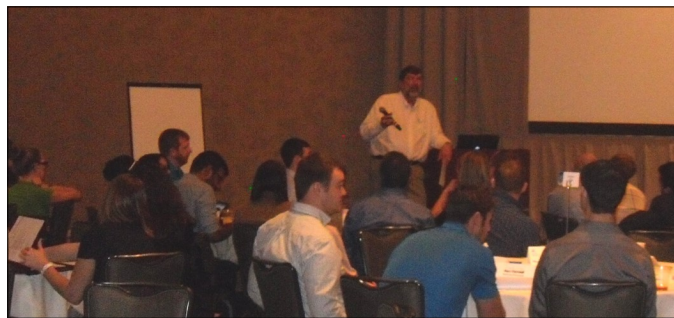
One of Many Speakers at the 2016 YP Summit