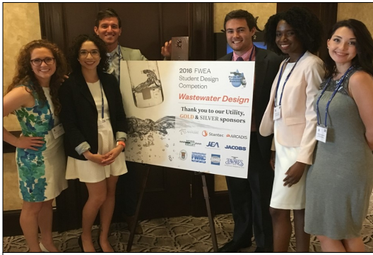
1st Place Wastewater Competition - USF

The Florida Water Environment Association (FWEA) SYPC hosted the 20th Annual Student Design Competition (SDC) on April 24th, 2016 at the Florida Water Resources Conference in Orlando, FL. The competition is intended to promote "real world" design experience for students interested in pursuing a career in water/wastewater engineering and sciences.