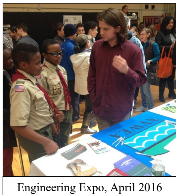
Engineering Expo, April 2016

The winter social event was held in February at Barcade. Over 30 people came out to network, play vintage arcade games, and have a good time.