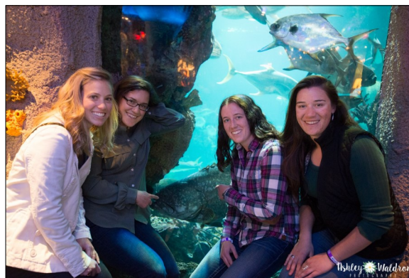
Young Professionals at Denver Aquarium