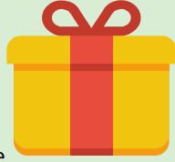
Exhibit Hall Food Functions

Prizes will be raffled at different times throughout the Conference. Attendees registered for the conference will be given raffle tickets, and there will be marked containers placed randomly throughout the Exhibit Hall—one for each prize. Attendees may put as many of their tickets as they'd like in each marked container. Raffle tickets will be drawn in the Exhibit Hall at various times during the conference. You must be present to win. Exhibitor representatives are not eligible for these drawings.