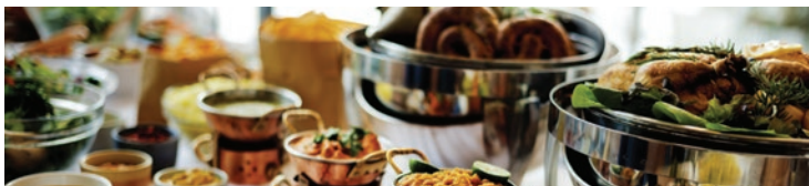
Exhibit Hall Food Functions

Prizes will be raffled at different times throughout the Conference. Attendees registered for the conference will be given raffle tickets, and there will be marked containers placed randomly throughout the Exhibit Hall—one for each prize. Attendees can put as many of their tickets as they'd like in each marked container. Raffle tickets will be drawn in the Exhibit Hall at various times during the Conference. You must be present to win. Exhibitor representatives are not eligible for these drawings.