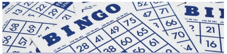
Exhibit Hall Bingo

The PWEA Exhibits & Sponsors Committee organized this event for Monday and Tuesday during the Conference.