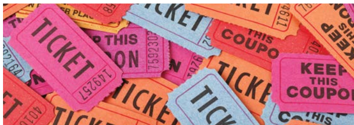
Exhibit Hall Food Functions

Prizes will be raffled at different times throughout the Conference. Attendees registered for the conference will be given raffle tickets, and there will be marked containers placed randomly throughout the Exhibit Hall – one for each prize. Attendees can put as many of their tickets as they'd like in each marked container. Raffle tickets will be drawn in the Exhibit Hall at various times during the Conference. You must be present to win. Exhibitor representatives are not eligible for these drawings.