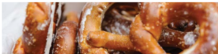
Exhibit Hall Bingo

The PWEA Exhibits & Sponsors Committee organized this event for Monday and Tuesday during the Conference.